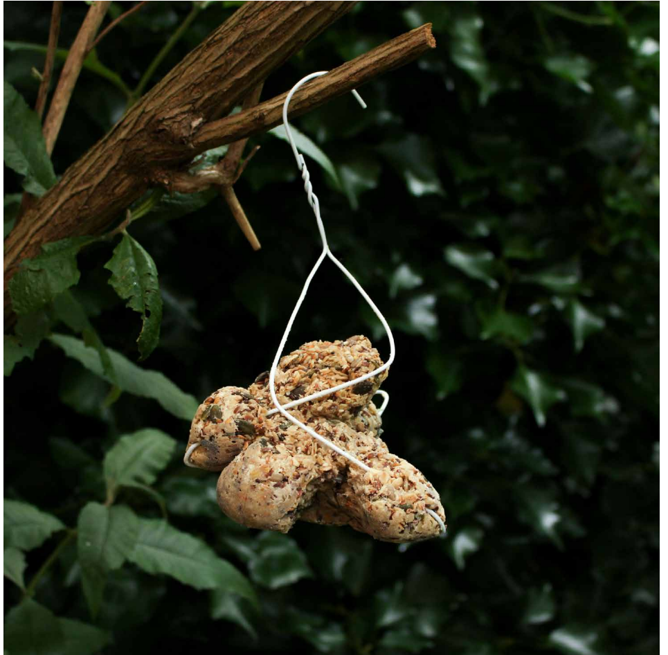
Bird food sculpture by Theo Tan

Be sure to share photos of your work with us using the hashtags: #SummerCraftChallenge and #GetCreativeOutdoors