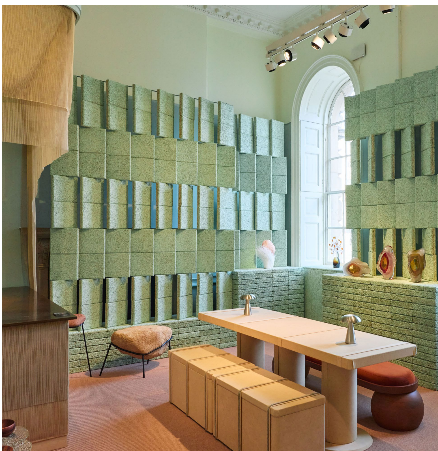
↑ Collectors' Lounge at Collect 2026, presented by Trimble SketchUp and designed by Tola Ojuolape Studio. Photography: Shin Miura

Sponsors of Collect include a discerning group of organisations which not only share the fair's mission to promote contemporary craft and collectible design, but also understand their wider cultural significance.