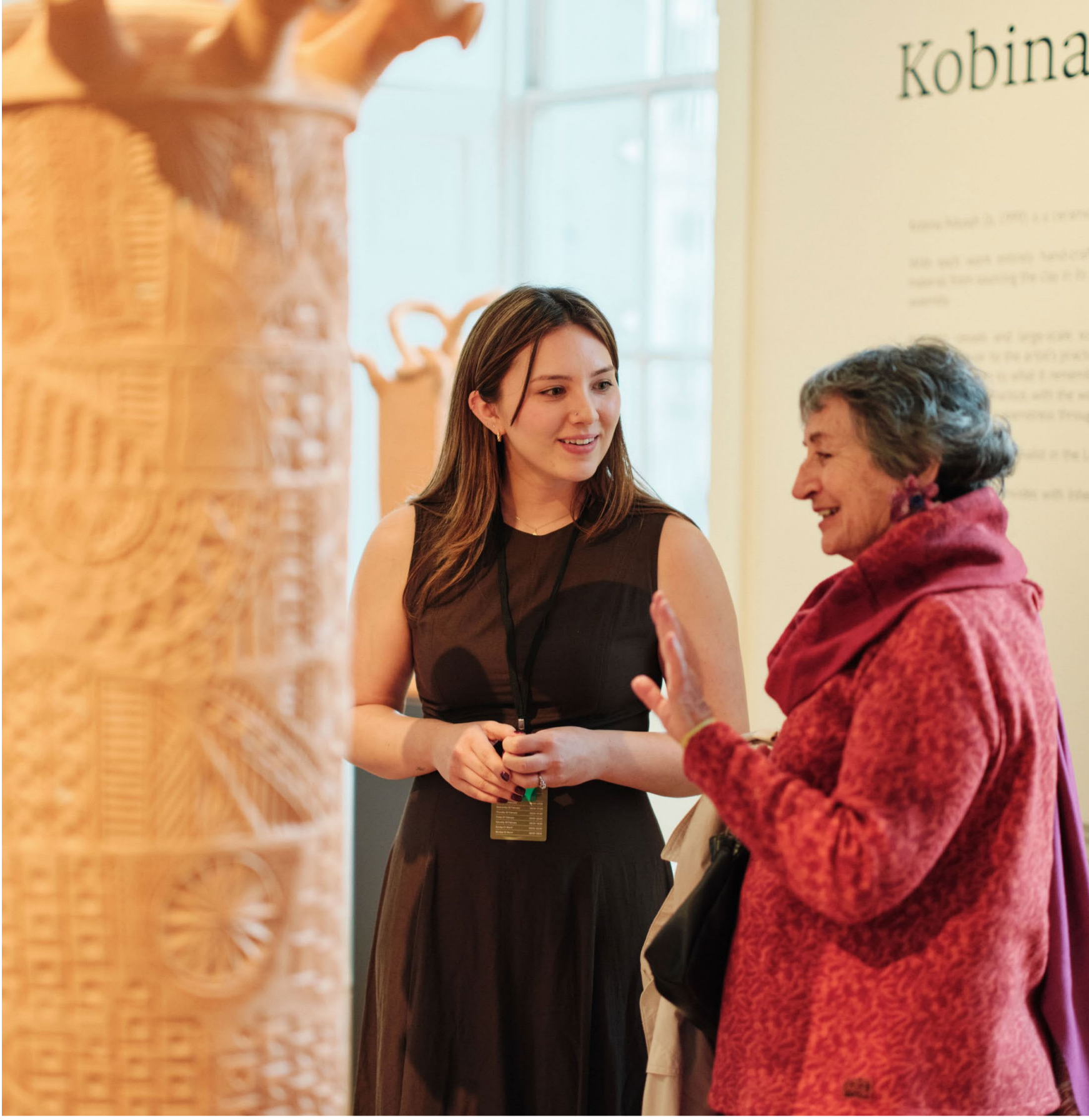
↑ Solo show by Kobina Adusah, presented by Gallery FUMI at Collect 2026.

Collect's exhibitor line-up includes pioneering galleries and arts organisations from around the world, dedicated to championing the finest contemporary craft and collectible design.