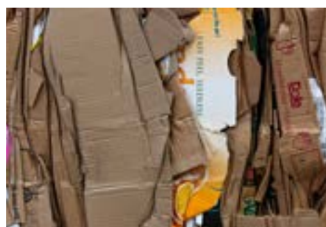
Try building a 3D object with cardboard.