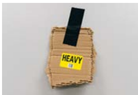
You can combine cardboard with different materials.