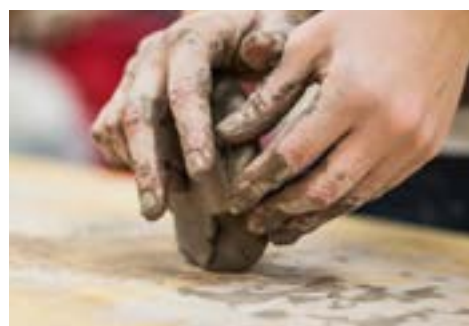
What other materials could you experiment with?

Be sure to share photos of your work with us using the hashtags; #EverydayMaking and #GetCreativeAtHome